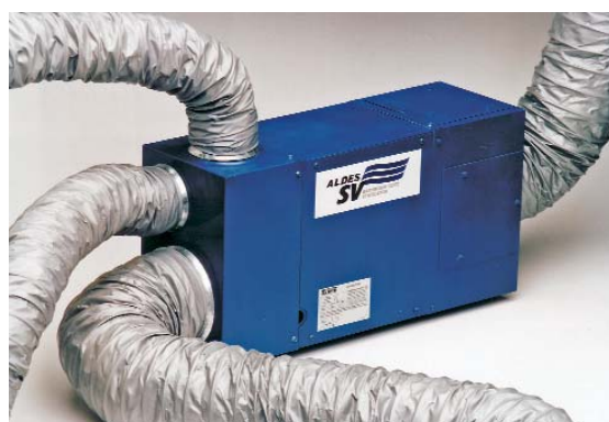
American Aldes multiport fans have a separate port for each duct run. This model has two 50-cfm ports and a larger port capable of . 100 cfm.

In-line fans such as the bullet-shaped Fantech mount directly in the duct and offer installation options. They are capable of venting several areas.