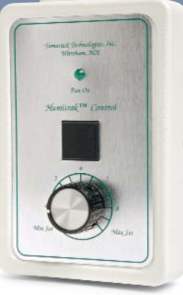
When the relative humidity reaches a preset level, this Tamarack Humitrak activates the fan.

Leviton's timer switch shuts off automatically after a specified amount of time has elapsed.