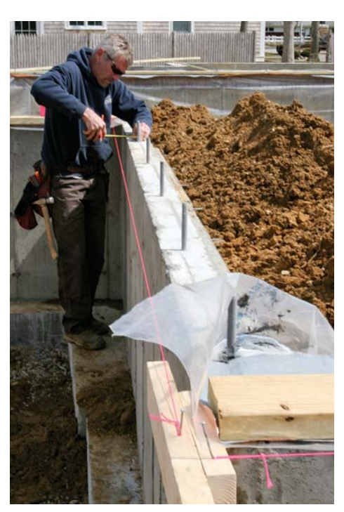
Narrow walls require offset strings. The tops of these stemwalls are only wide enough to carry the 2x6 walls, so the carpenters attach 2x spacer blocks to the stemwalls, and then they fasten an offset stringline to the blocks to use as a reference for measuring.