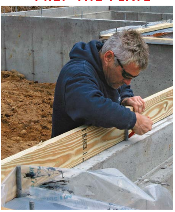
Make your mark. To locate the bolts accurately, the mudsill is laid on edge across the top of the stemwall, and each bolt location is scribed onto the face of the 2x6.