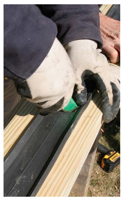
The gasket is treated separately. The soft and stretchy EPDM gasket (sidebar p. 67) tends to get snagged and wrapped up by a spinning drill bit, so after the other layers are drilled, the gasket is stapled to the underside of the mudsill and sliced with a utility knife at each bolt-hole location.