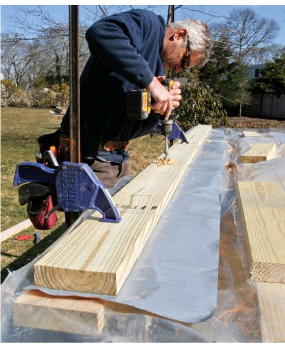
Drill the layers as a sandwich. Although they started out marking and boring through each layer separately, the carpenters quickly learned that it's faster to stack up the poly, termite shield, and 2x6 mudsill; clamp them together; and drill through everything at once.